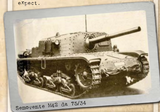
Semovente M42 da 75/34

The semoventi are part of the artillery arm, the elite of the Italian Royal Army. Despite the small crew, the excellent range-finding capabilities of the Carro Comando combined with their artillery training enable them to score far more hits than their enemies would expect.