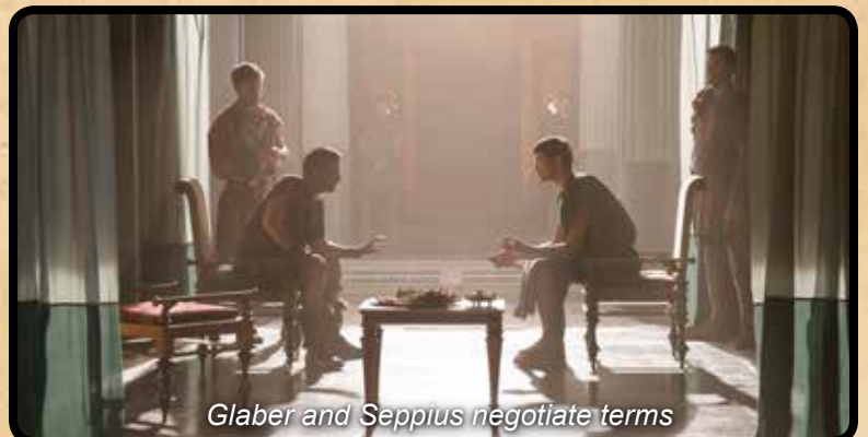
Glaber and Seppius negotiate terms