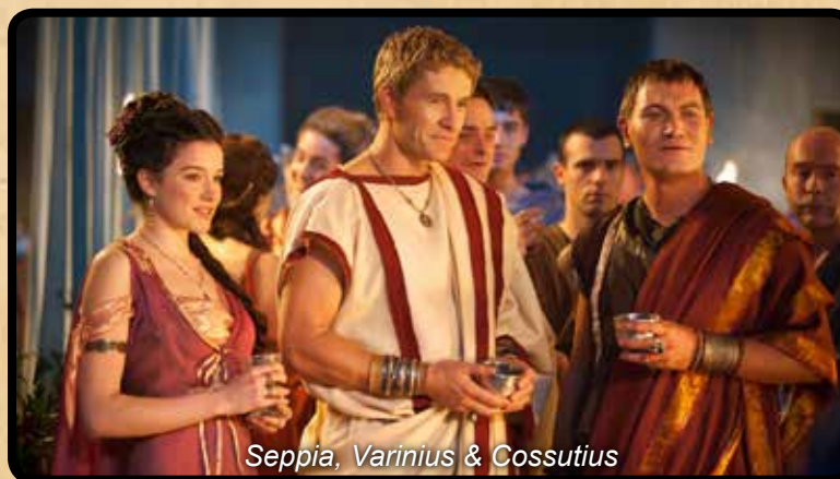
Seppia, Varinius & Cossutius

Praetor of Rome: Varinius may call upon Rome for the support of her legions. Varinius may not use this ability if there are no Guards in the discard pile. Guards retrieved from the discard pile are placed on the table face down as an Exhausted Asset. In games including House Varinius you may opt to keep a separate discard pile for Guard Cards to help expedite the use of this Special Rule.